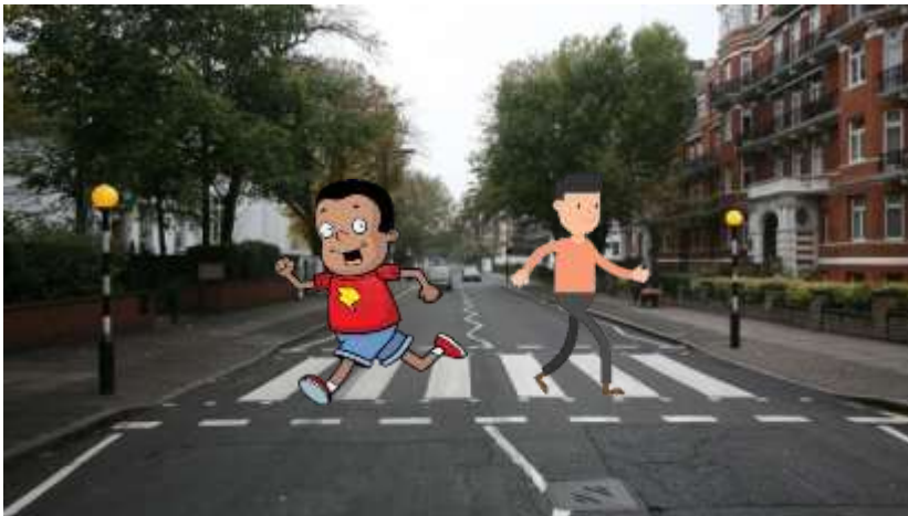
FIGURE 1,CROSSING 1 – THIS IS A ZEBRA CROSSING (IT HAS NO TRAFFIC LIGHTS)

Give here two pointers about how to cross a zebra crossing