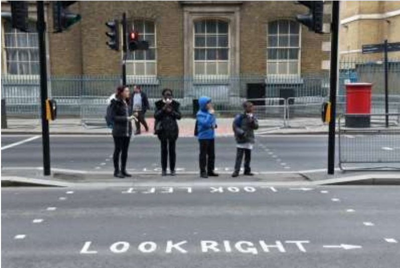
CROSSING 2 – THIS IS A PELICAN CROSSING

Can you tell what a pelican crossing is? What is a puffin crossing? How do I cross safely at a pelican/puffin crossing?