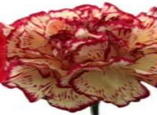
Purple & White